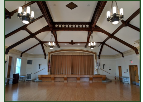
The Town Hall auditorium is a featured room now available to rent for special events.

To review all the new room rental policies, fee structures, rules and regulations, or to fill out a rental form for either standard use or a special event, one can visit the "Forms and Downloads" section of the Township website and obtain all the necessary paperwork. For more info about room rentals at the Town Hall, please stop by the Township office or call during regular business hours.