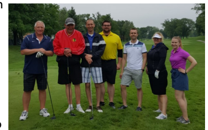
Representatives from Riverside Township in this year's charitable golf outing.

On June 11th, Riverside Township participated in North Riverside's 2018 Mayor's Golf Outing at the Riverside Golf Club. It was a rain-soaked morning, but that didn't deter Board members and staff from showing up and proudly representing Riverside Township in this charitable golf tournament. The Township sponsored two foursomes for the annual outing and all proceeds from the event go to the North Riverside Youth Program & Educational Scholarship Fund, Inc. The scholarship fund provides opportunities for young people in the community to enroll and participate in various recreational programs, assists with preschool tuition, and helps to offset the costs of higher education for young adults. Riverside Township is honored to be able to participate and support this worthwhile community event, year after year.