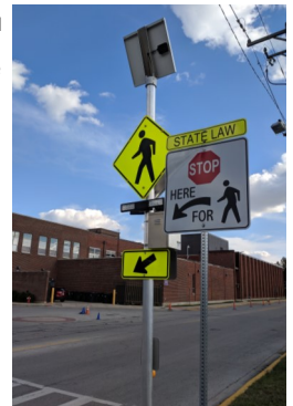
The new crosswalk signal and signage on Golf Road.

This past May, The Riverside Township Board generously awarded a joint grant to the Riverside and Brookfield Police Departments for the purpose of enhancing pedestrian safety on Golf Road by Riverside Brookfield High School. As a result of the grant, solar-powered pedestrian crossing signals were installed in July, placed at both ends of the crosswalk that connects the main high school entrance on the east with the sidewalk and football field on the west. The highly visible signals flash when triggered by a pedestrian at either end of the intersection and reinforce to motorists that they must stop for pedestrians in the crosswalk, by law.