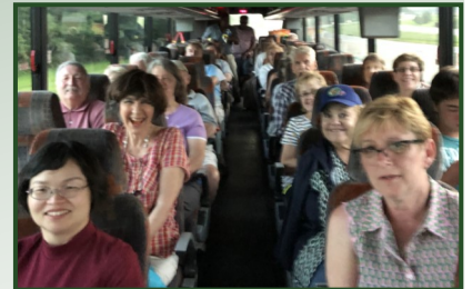
A bus full of residents on their way to the Illinois State Fair.

On Saturday, August 11th, Riverside Township once again arranged for an all day trip to the Illinois State Fair. This year, 48 township residents boarded a coach bus in front of the Town Hall and headed on their way down to Springfield. Everyone spent the entire day freely exploring and seeing the many sights and sounds the State Fair had to offer, from various musical acts and entertainment, to special exhibits and attractions, carnival rides, public competitions, and unique foods. The State Fair had a little something for everyone! The group returned home late that same evening and many came back with enjoyable stories to share of their day-long experience. The Township hopes to continue to schedule a trip each year to the Illinois State Fair for residents, and turn this event into an annual tradition!