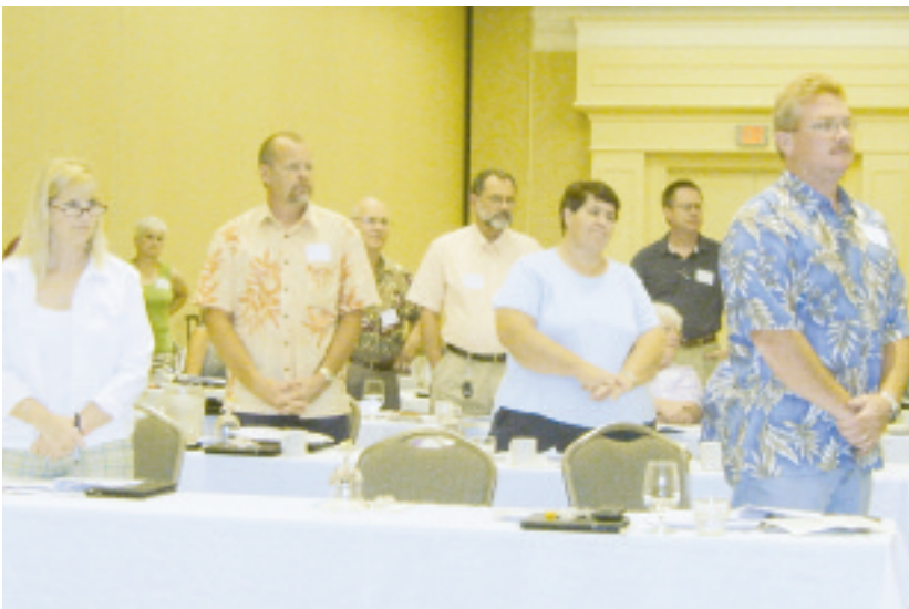
^ July 10, 2009 in Fairview Heights - newly elected Supervisors are standing.