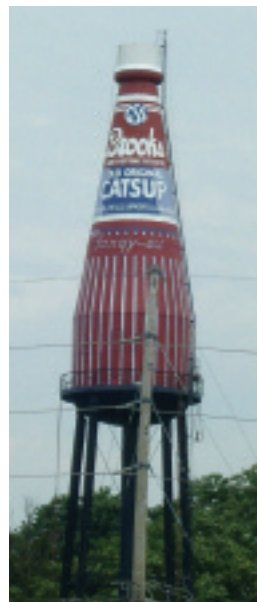
< July 10, 2009 World's Largest Catsup Bottle just outside Fairview Heights - the perks of traveling.