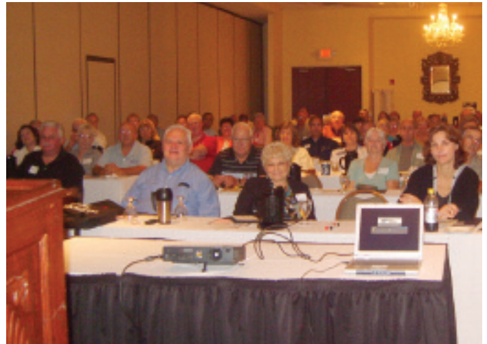
^ June 19, 2009 Supervisor's Zone Meeting in Rockford, IL.